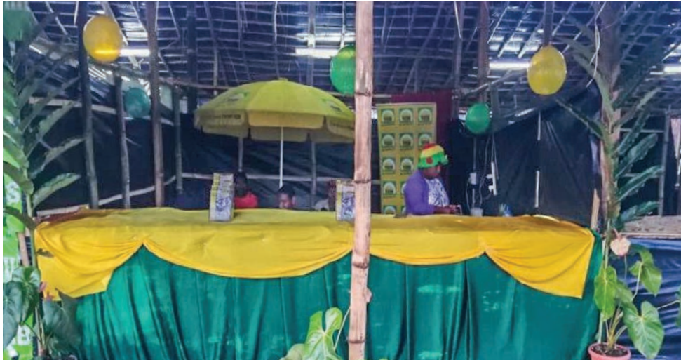
NDB Stall at Goroka Show prepared awaiting gate to open for crowd for begin.

The National Development Bank was a Plate Sponsor of the recently concluded Goroka Cultural Show.