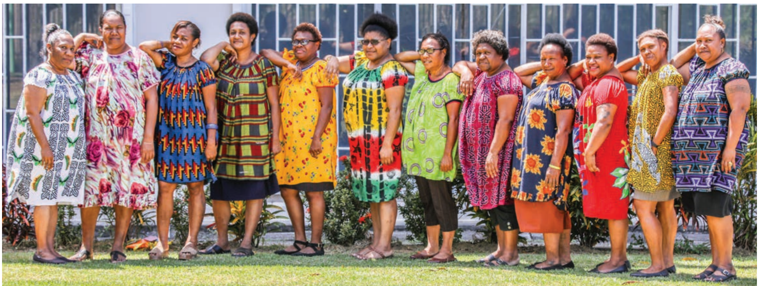
Head office ladies posing for a photo shot in their meri blouses.

More than thirty years ago wearing of meri blouses was closely associated with the women from the New Guinea Islands Region. As years passed, the Highlands and Momase Region women came in with their modification adjustments especially the women